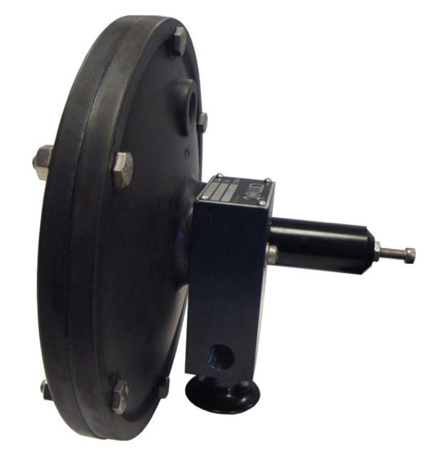
Type 4126 Crankcase Pressure Sensing Valve