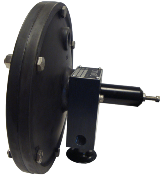
Type 4126 Crankcase Pressure Sensing Valve