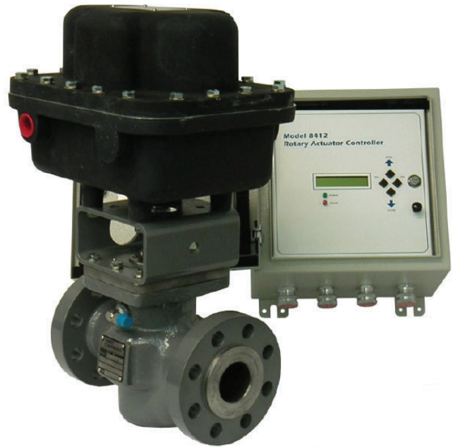
Model 8402 Gas Turbine Fuel Control Valve